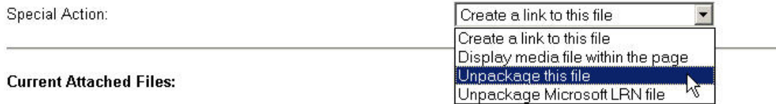
Figure 3. Uploading WinZip file to a Blackboard Course site.

This information was created by the Faculty Development Center at California State University, Fullerton. California State University, Fullerton © 2003. All rights reserved. For questions or comments you may contact: